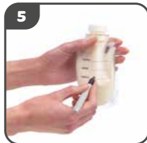
5 Pouches should be marked and dated for reference using a soft tipped marker so as not to damage the bag. Depending on how the milk freezes in the bag, you may not get an accurate read so we recommend recording the volume expressed in the 'notes' section

DISASSEMBLE THE REST OF THE UNIT AND STERILISE ALL PARTS AS PER MANUFACTURERS GUIDELINES