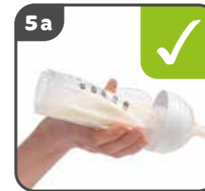
5a When ready to feed, remove hood. Always ensure the pouch is upward facing. Once feed is finished dispose of pouch and wash/sterilise all other parts as per manufacturers guidelines