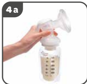
4a Once you have finished expressing or when the pouch is full, unscrew from the pump and replace the screw cap