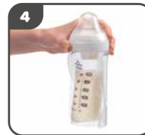
4 The pouch bottle is now ready to use