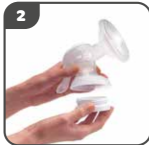
2 Screw the adapter on to your breast pump