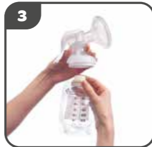
3 Attach the pouch to the pump/adapter and express. Keep the pouch cap in a clean safe place so it can be replaced after expressing