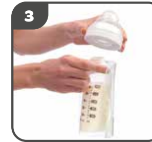
3 Screw the assembled ring and teat to the pouch and holder