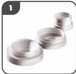
1 Select the relevant adapter for the brand of breast pump you are using

Breast milk can be expressed directly in to express and go breast milk pouches using our breast pump adapters