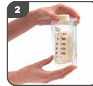
2 Place pouch in to the holder and click in to place. Ensure the measurement markings are facing outwards - remove screw cap once in place