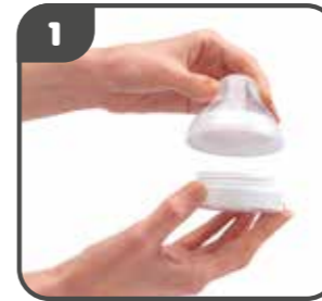
1 Leaving hood on teat, attach to screw ring adapter

Ensure all pouch holder and teat parts have been washed and sterilised as per guidelines before use